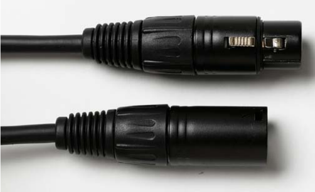
Model 6869-180*, -300*: XLR Plug/Jack Cable 15 feet, 25 feet